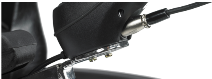
23. The charge light on t