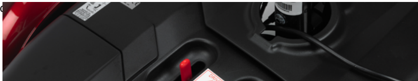
25. The chair is now read