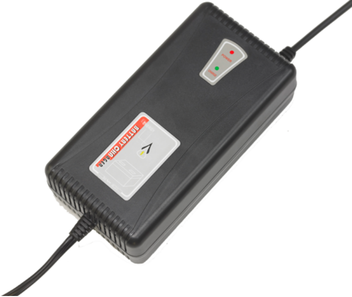
er from the chair and