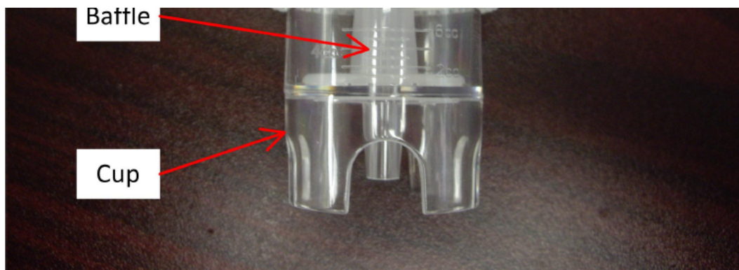
Figure2. Parts of assembled nebulizer cup