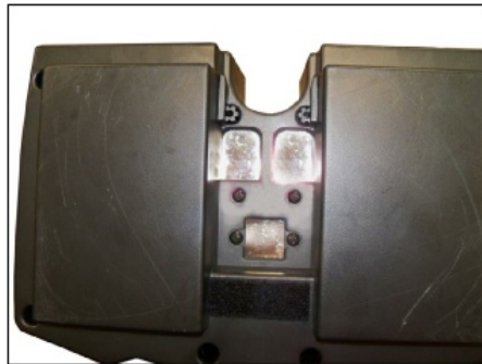
12 Amp Scout Battery (underneath)