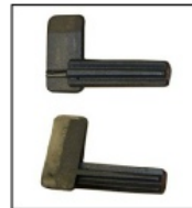
Battery Box Aligners to insert